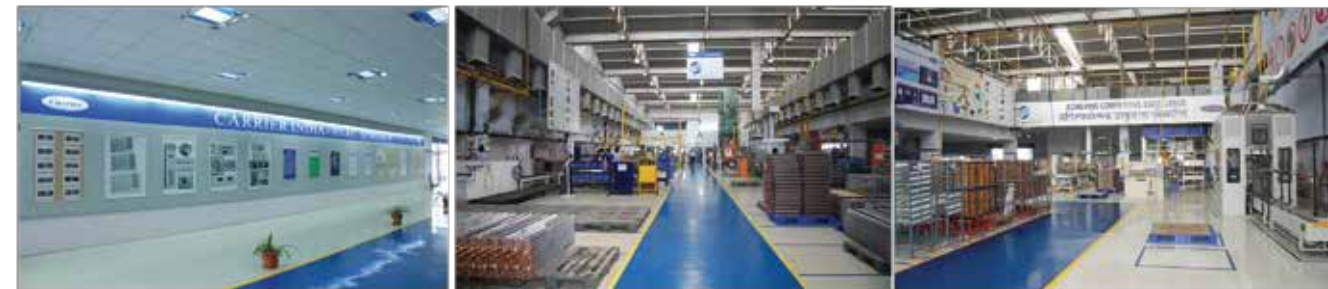
Snapshots of Carrier India manufacturing facility

Our comprehensive Environment, Health & Safety (EH&S) program establishes a framework and provides tools for implementing our EH&S practices into our business & culture. The Carrier Gurgaon facility holds a distinctive record of delivering over 17 million man hours without a lost work day incident, clearly citing the measures of safety followed here.